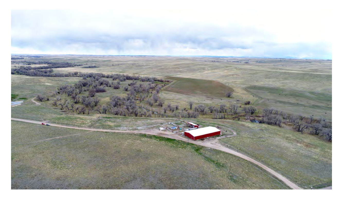
Tract 16 - East Ranch, 143.3 Acres