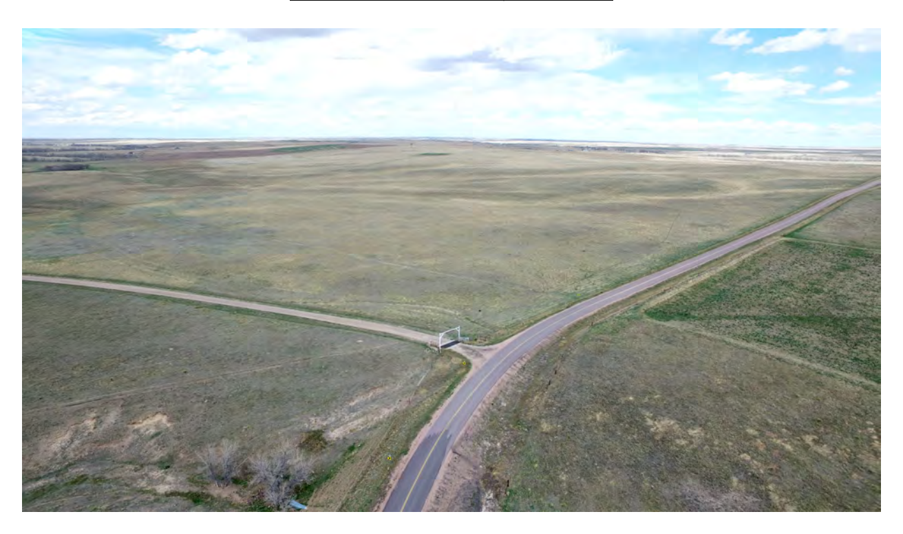
Tract 17 - East Ranch, 160 Acres