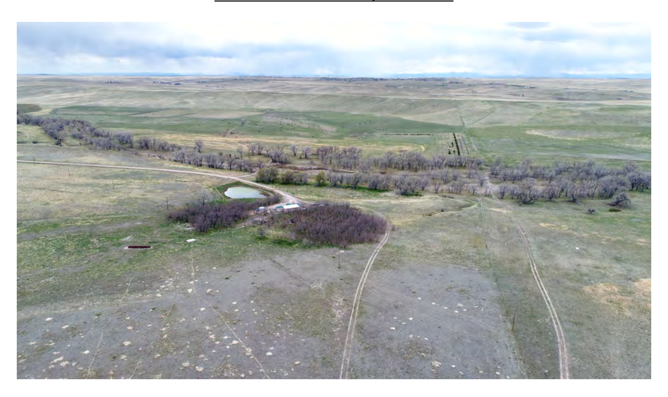
Tract 13 - East Ranch, 160 Acres