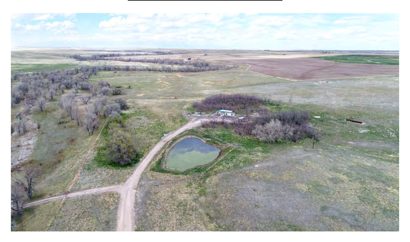
Tract 14 - East Ranch, 907.7 Acres