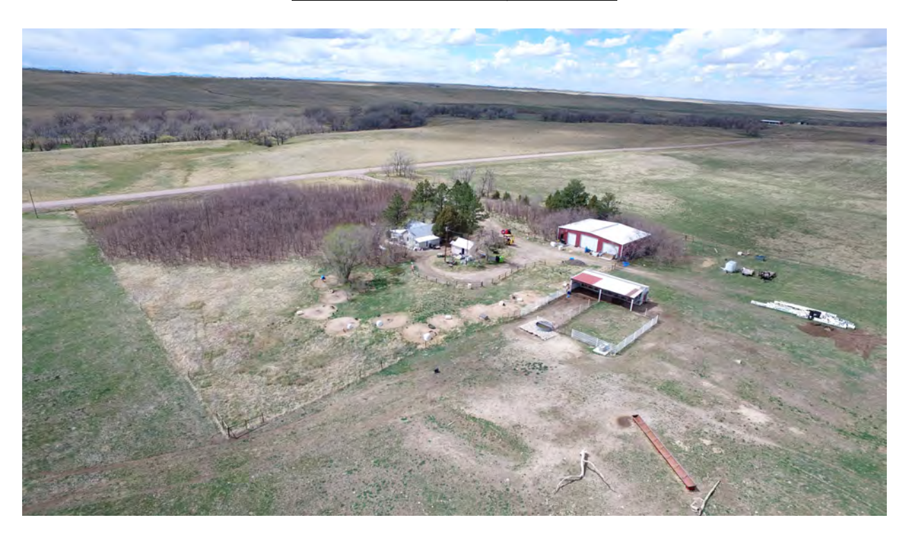
Tract 18 - East Ranch, 315 Acres